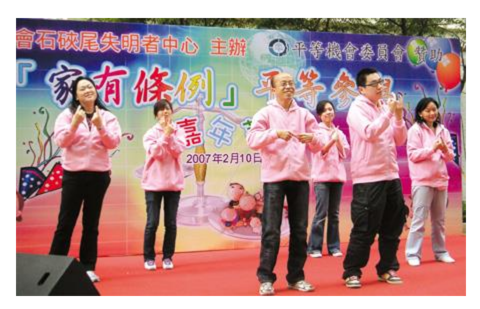
At an EOC funded event, volunteers sing with their hands and share their sign language skills at the roadshow organized by Shek Kip Mei Lutheran Centre for the Blind.